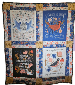
Handmade Lap Quilt