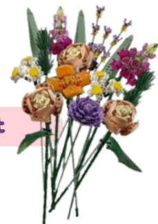
Lego Flower Bouquet