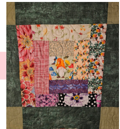
Handmade King Size Quilt